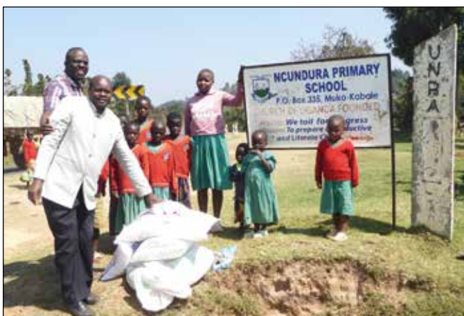
Food supplies for nine primary schools