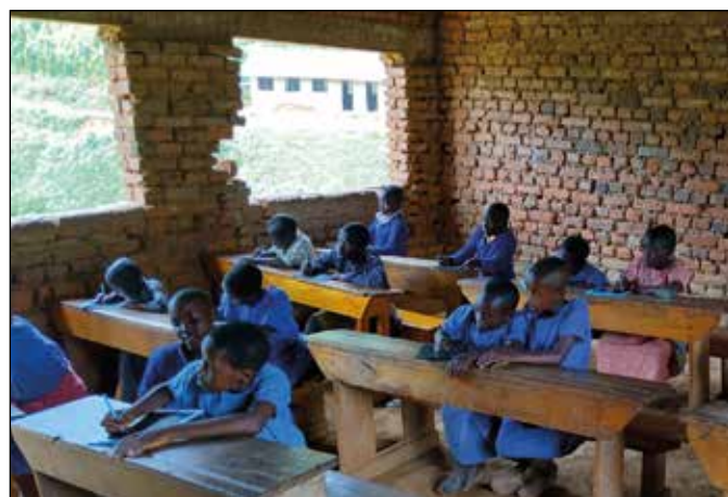
An education opportunity for all