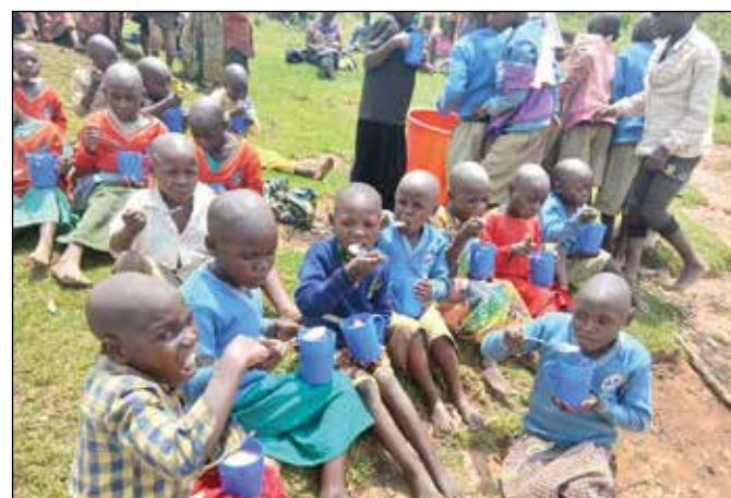
Lunch for all hungry children

We believe the Lord has called the WADU team to work amongst the Batwa. We are overwhelmed by their selfless commitment and excited to see how God is using them. It is our responsibility to ensure a realistic salary so they are able to care properly for their own families. Also to ensure an adequate working environment and necessary equipment and to enable their transport to the rural communities they are serving. Throughout 2024 and 2025 we have maintained good salary levels and provided office overheads. Also we have maintained and provided fuel for the vehicle. This all comes at a cost which is regular.