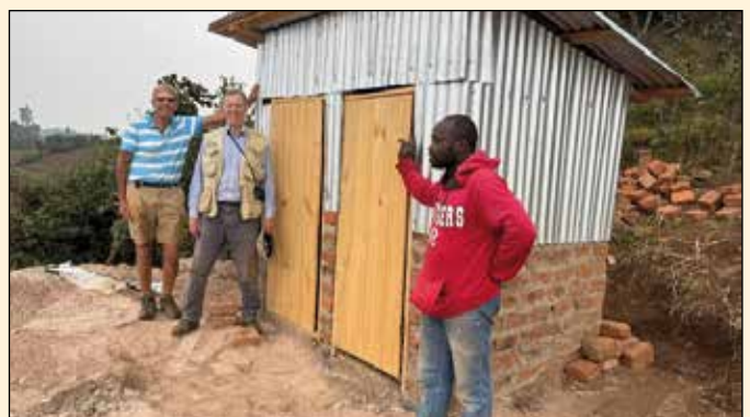
2025 team completed latrine

visiting WADU in 2024 and 5. Again funding has been generously provided. More funding will be needed but WADU now expect Batwa men from the villages to construct the latrines themselves.