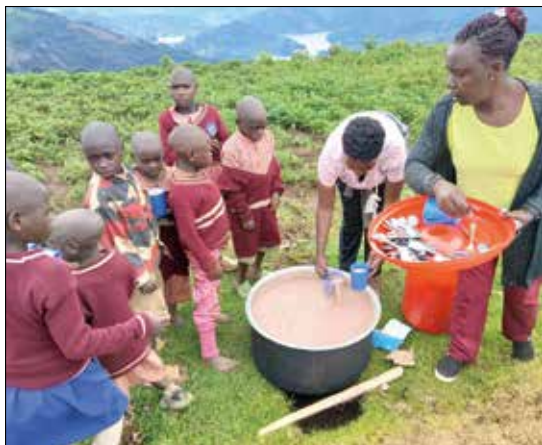
An enriched nutritious porridge lunch

is always served to children and whole families. Health improvements are obvious. Rarely does WADU have to deal with jiggers in feet nowadays. These gatherings are opportunities for evangelism and it is exciting to see Batwa children and families growing in the love of God. These centre days generate a regular cost which is also part of our monthly funding.