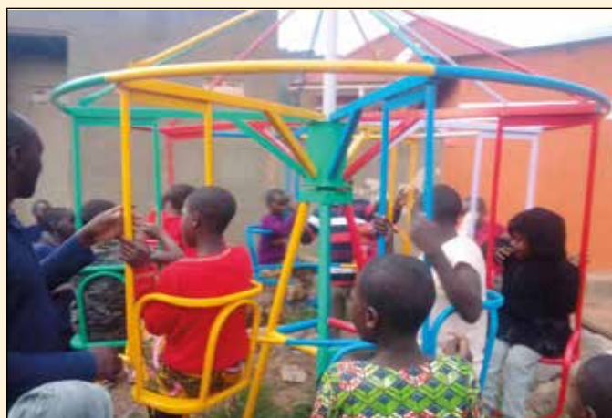
Thank you Stanton Harcourt for our play equipment"

St Peters School decided to partner with WADU in 2025 and raised funds for water purifiers which the visiting team were able to present to two schools. They also