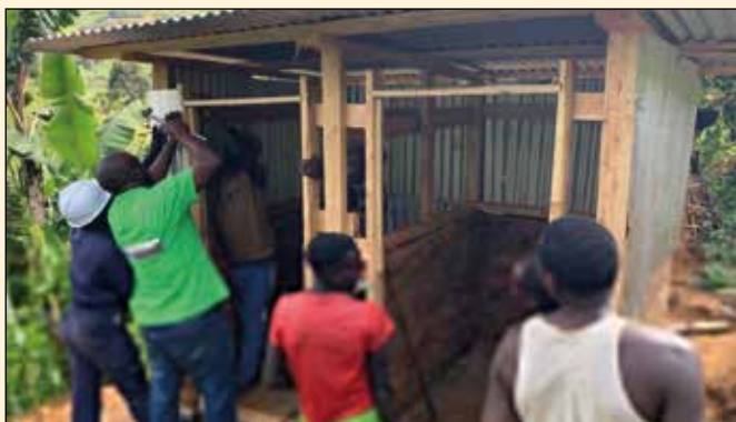
Learning to construct a latrine

As part of the very necessary aim to encourage better hygiene WADU have embarked on a programme to encourage use of proper latrines. Three have now been built with the help of those trustees and friends