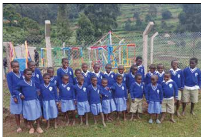
Regular provision of new school uniform