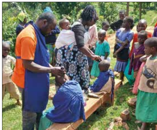
Regular hair cutting