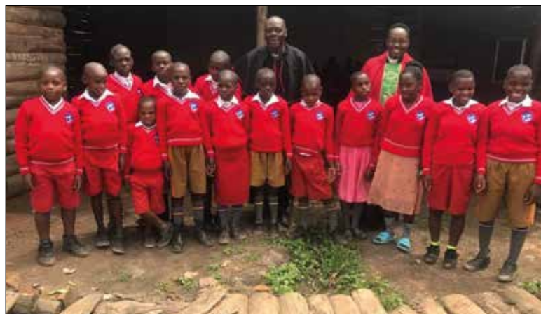
Rising Stars ready for a new term—"how smart we look!"

If you might be able to offer sponsorship please get in