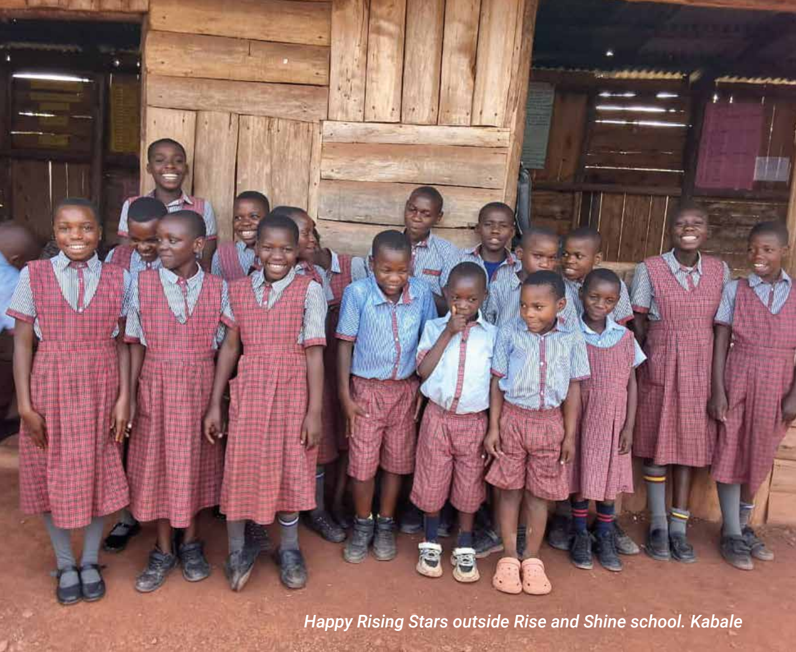
Happy Rising Stars outside Rise and Shine school. Kabale