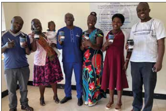
Our precious WADU team

As you join us in thanking God for His faithful provision please consider whether you can help sustain this valuable ministry by increasing your current standing order, or by deciding to make a standing order. All donation information at the end of this report.