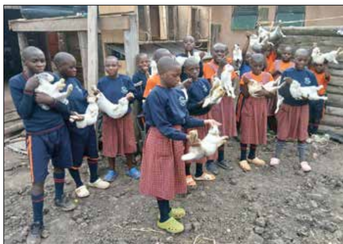
Livestock, mattresses, blankets, the Word of God in my language – all life changing gifts

touch with sponsorship.cduganda@gmail.com or make this need known amongst friends and family.