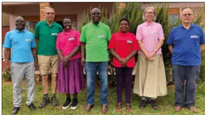
2024 visitors with WADU team