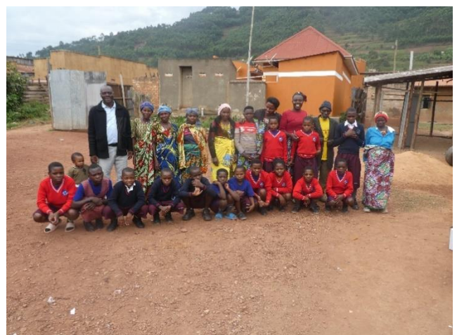
Parents and WADU staff visiting the children at Rise and Shine school on one of the school visitation days.