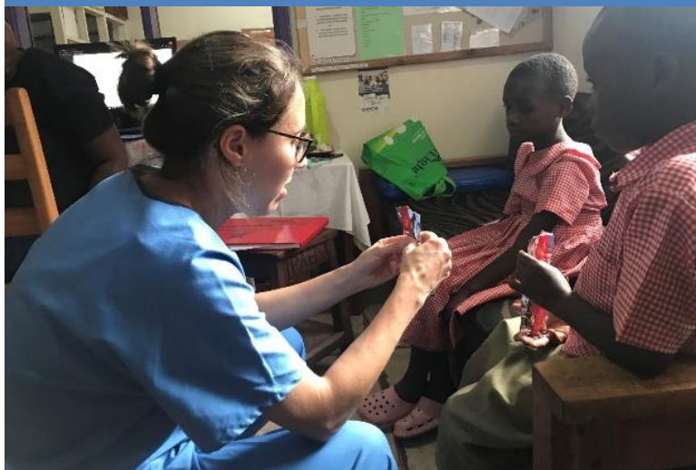
Nurse administering Ready to use therapeutical food to the children