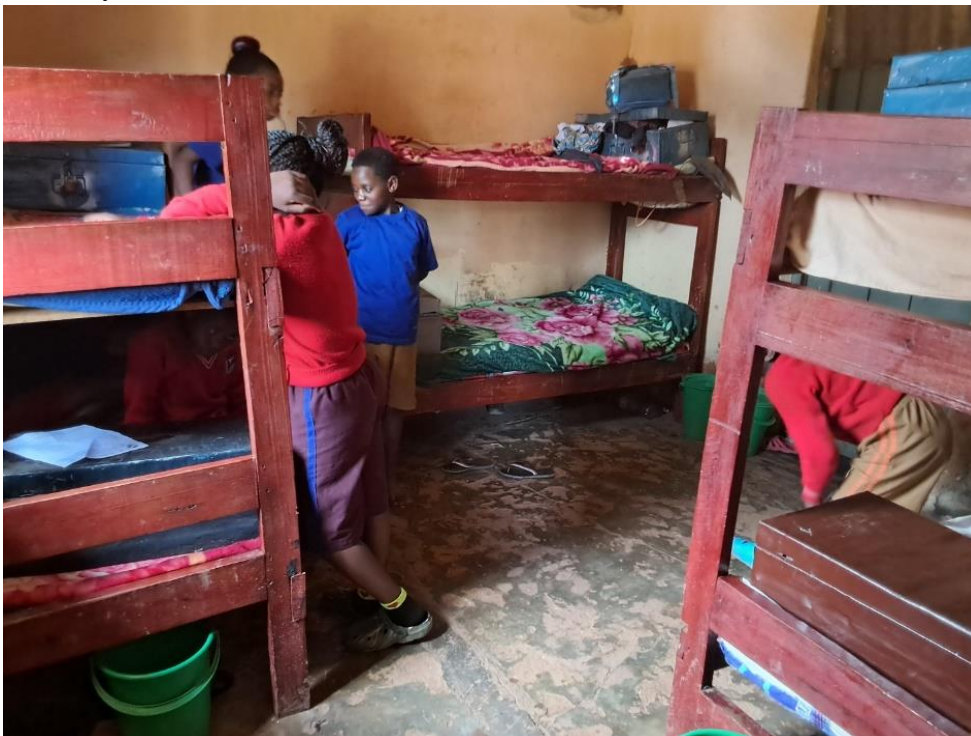
Girls inside the boarding facility at Rise and Shine Preparatory school