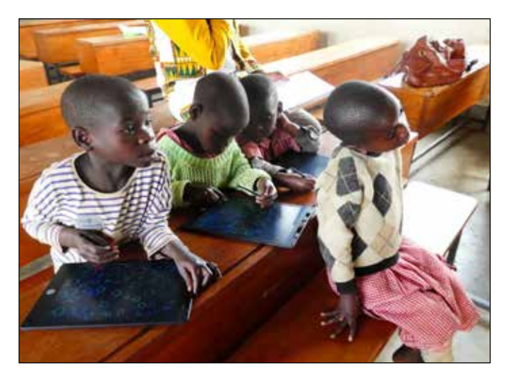
Small group learning with LCD writing tablets

It is always a privilege when someone visits Kabale to be able to take gifts. Our visit this year was no exception. In addition to some personal gifts to the WADU team, we were able to take a great quantity of knitted goods:- blankets, babies vests and hats, many of which had been knitted and stored up over Covid. A big thank you to everyone who helped in this way. On