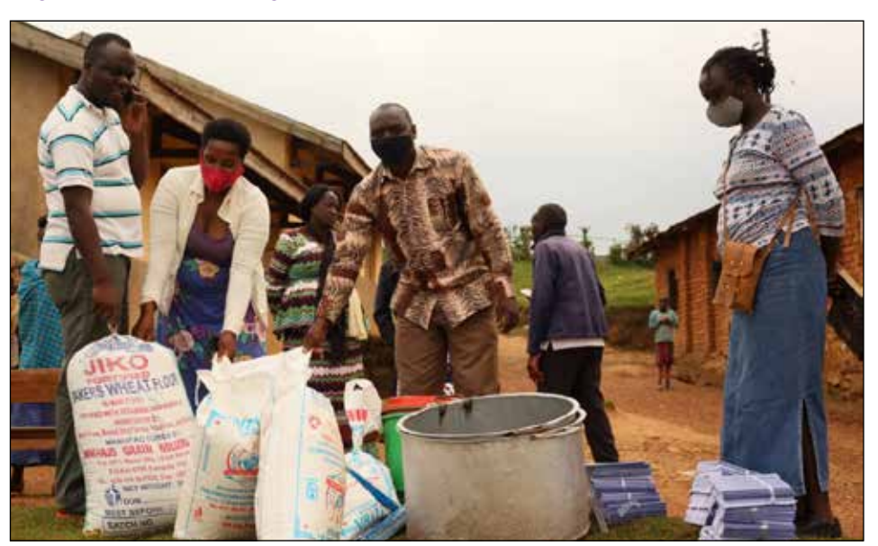
Beginning of term food supplies