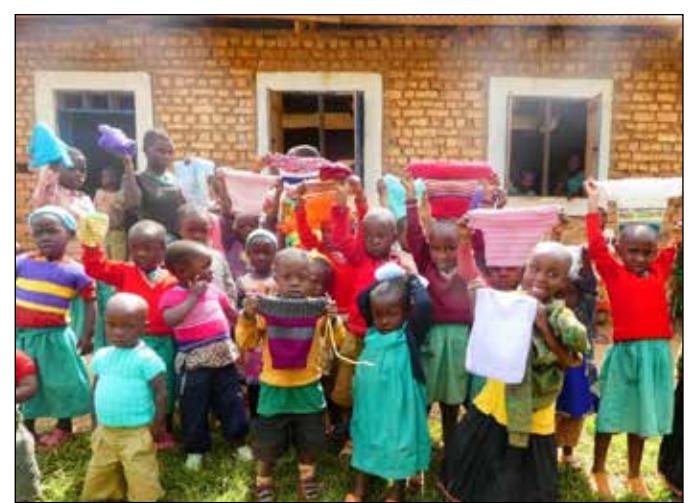
Thank you to all knitters

At the request of WADU we also took with us 12 LCD writing tablets. These are proving invaluable for the WADU team and some teachers for helping with one to one and small group interventions with the children in schools. They are so successful that we are looking to provide more.