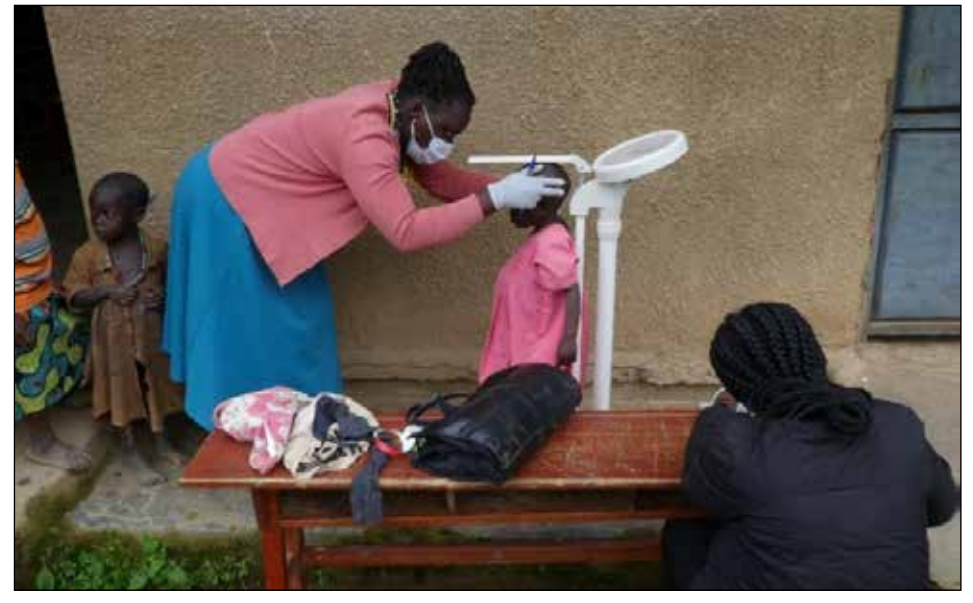
Regular health monitoring

The Christian Development Uganda general mission fund will need long term regular support but that is what will sustain this valuable ministry. We are so thankful for all our regular donors. Our prayer is that God will also raise up some younger folk with a burden for this mission.