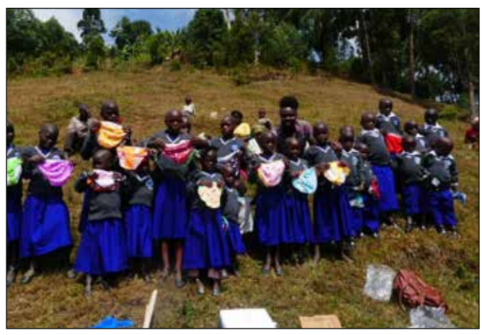
A big thank you from the girls