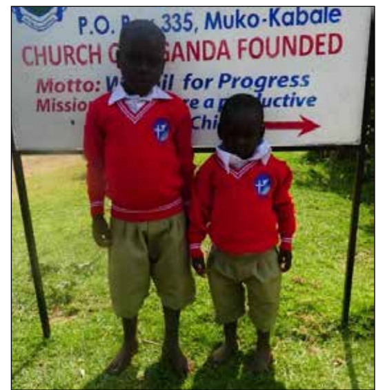
Proud in our uniforms