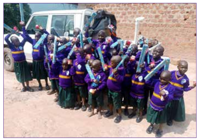
Christmas visit to these children in the new vehicle

This provision demonstrates how God can use the gift of a legacy. If you have never considered leaving a legacy to Christian Development Uganda perhaps this might encourage you to do so.