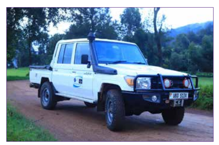
The WADU Toyota Land Cruiser displaying WADU and Christian Development Uganda logos

Throughout 2023 the prayers of our trustees and of WADU have been that the Lord would provide WADU with a suitable vehicle for their ministry. Daily access to all the Batwa communities is essential and using hired vehicles was becoming difficult and unreliable. To enable WADU to purchase a suitable 4 by 4 double cabin required funds that Christian Development Uganda did not have. We needed to raise funds and so launched our vehicle appeal. We received some very generous donations to this appeal, and a fund raising concert that was held at Saint Ebbe's Church, Oxford, did a lot to advertise the appeal and raise funds. The appeal raised over £20,000 and wonderfully we received an unexpected legacy of £21,000. In faith trustees instructed WADU to search for a vehicle in December and the Toyota land cruiser was found matching almost exactly the funds raised. We have a faithful God. Please give thanks with us for this incredible provision.