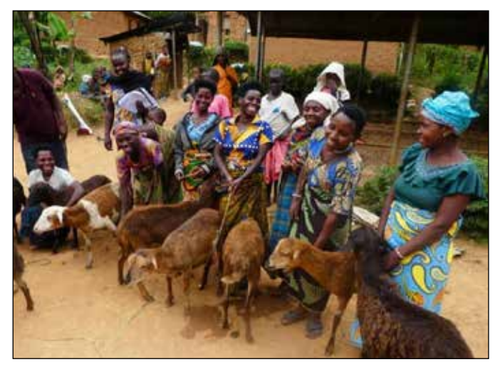
Joyful thanks for the gift of sheep.