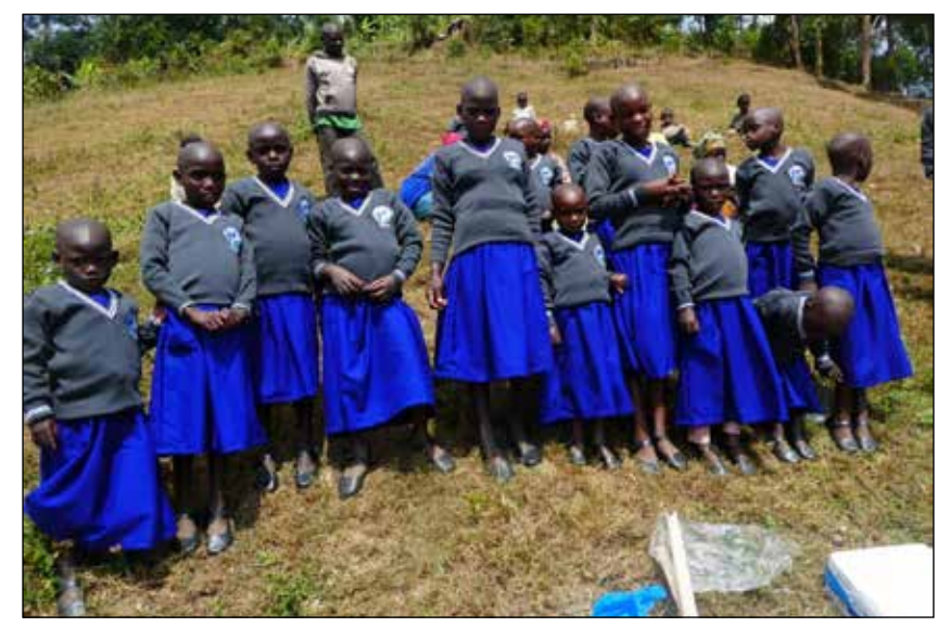
New uniforms and shoes

successful. The uniform appeal raised a little over £2,000 the shoe appeal £510. As a result, amidst great excitement, WADU were able to provide school uniforms for the Batwa children attending all nine schools and also provide school shoes. We thank God for the generosity that enabled this very basic provision.