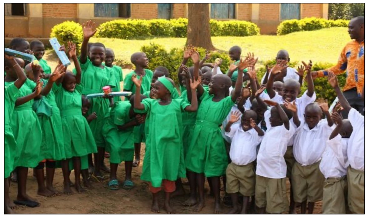
Ready for the new school term

Regular visits are made to all the schools, with special educational interventions for some needy children, by the WADU team.